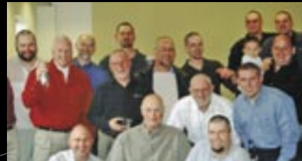
AG supports its "family" members during a Cut for Cancer in 2005