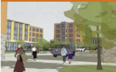
Aging in Community – A Senior Living Ideas Competition

AG continues to evaluate their internal business structure and improve their business processes. They have created a strong middle management team and continue to refine their service methodology. The AG clientele appreciates the depth of experience on the leadership team. This creates opportunity for these leaders to mentor the other members of the team and support their professional growth. While AG takes the time to reflect on their past, they are poised for the future — the future of their community as well as the future of the senior living industry.