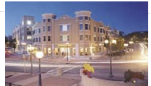
AG Office – Lefebvre Pointe

the time to mentor a new generation of architectural and engineering talent to become the future leaders of the firm. In order to embrace a new generation of architects and engineers, AG relocated its office in 2002 from a suburban strip mall to the heart of a vital historic village. They were rewarded with the opportunity to design their new office location. This was part of a new branding initiative with a focus on creating a sense of community.