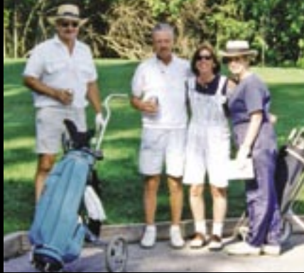
Employees, consultants & clients always enjoy the AG Golf Outing