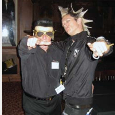
AG ANNUAL AAHSA CLIENT EVENT Elvis Library & Hard Rock Cafe at the Universal City Walk.

AG Architecture joined fellow senior living experts, service providers and care givers for the 2007 AAHSA Annual Meeting. Hosted at the Orlando Convention Center, this year’s meeting brought attendees to a city where the theme is all about being young at heart.