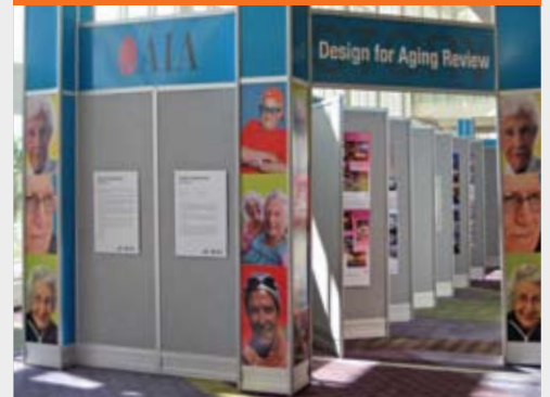
Eastcastle Place Milwaukee, Wisconsin